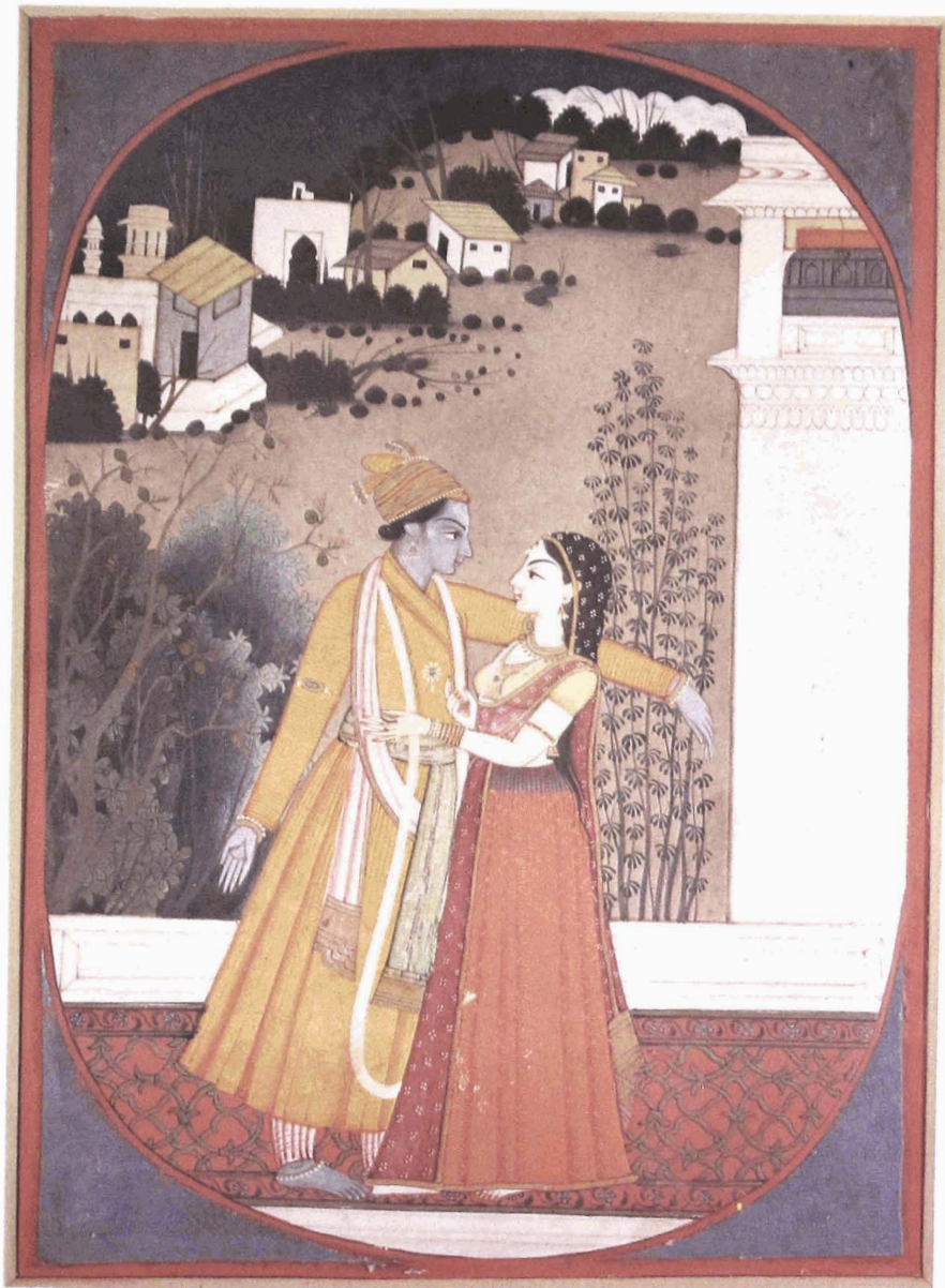
A. The month of Phagun. Garhwal, c.1780-1790. Garhwal, 5(iii).